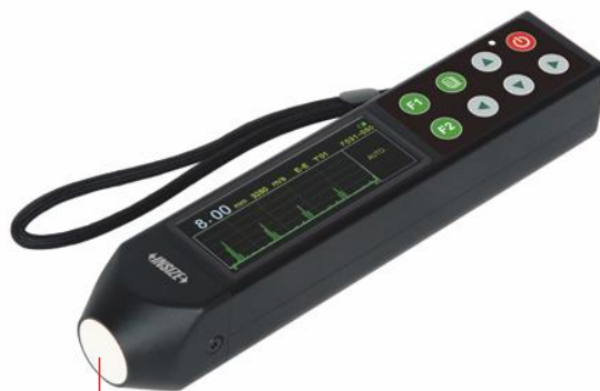
normal temperature probe(included)