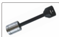
high temperature probe (optional)