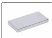
calibration block (included)